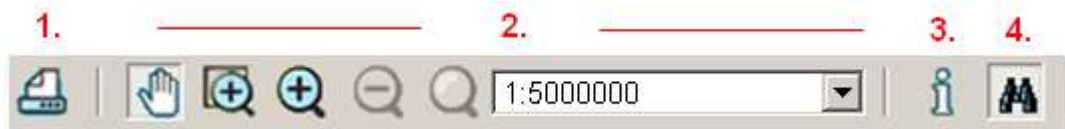
Picture 3. Search menu

Buttons in the top menu are used in finding locations. For example, the zoom and other functions work the same way as in most map programs (2). Map search based on name of the municipality is also possible (4). The print button (1) allows you to download map images e.g. in JPEG format. Information button (3) is used to get detailed information in a single or in a number of cells.